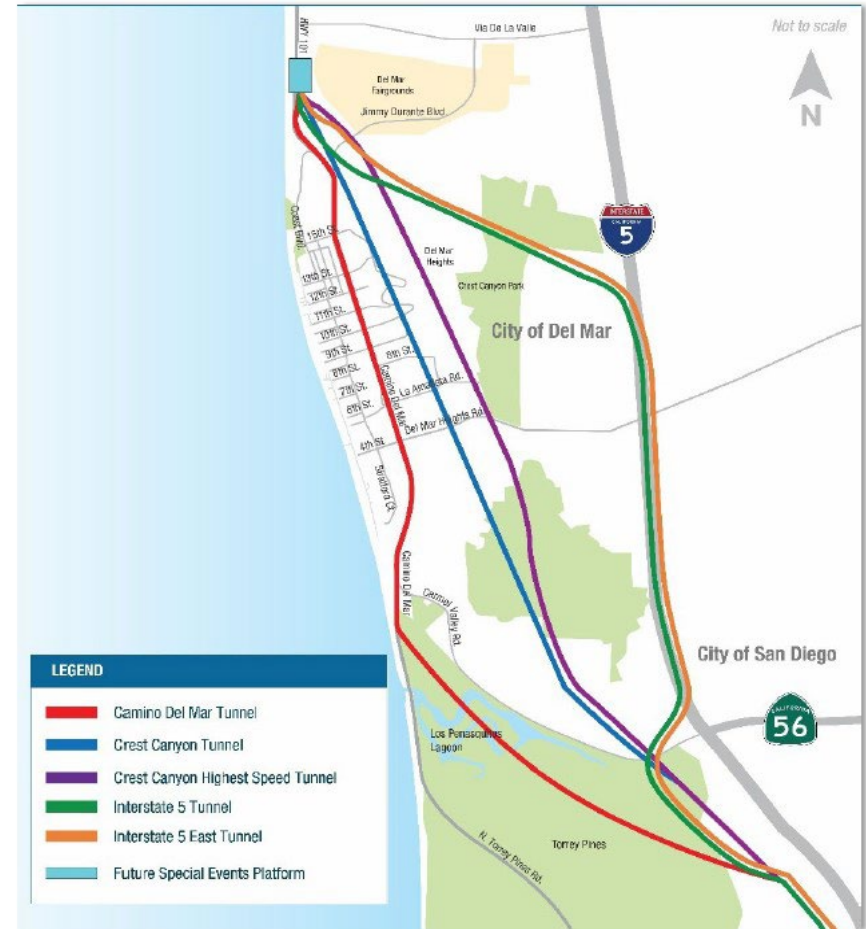
Figure 5 – Potential Future Realignments of LOSSAN Rail Corridor in City of Del Mar